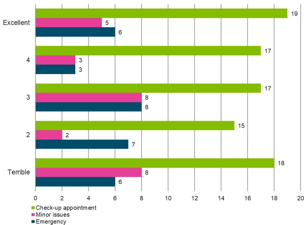
Rating of overall experience of different types of appointment (On 5 point scale Excellent - Terrible)

When asked to rate the overall experience of different types of appointments, the responses received were very mixed and show a spread of ‘excellent’ to ‘terrible’ experiences. There are several factors that influence people’s rating, but there are clearly opportunities for experiences to be improved. While Covid has presented unforeseen difficulties that all dental practices have had to negotiate, it appears that some dental practices have maintained a more rounded and responsive service than others.